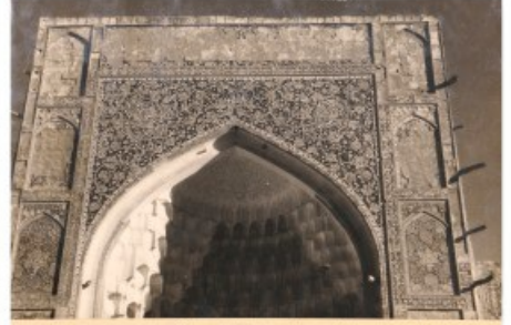
Bokhara fragment of the Abdul-Azis-Khan Medresesi. 1651-1652