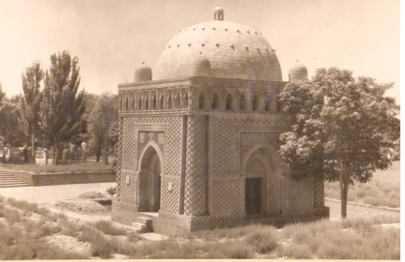
Bokhara. The Ismail Samani Mausoleum. IX-X cc.