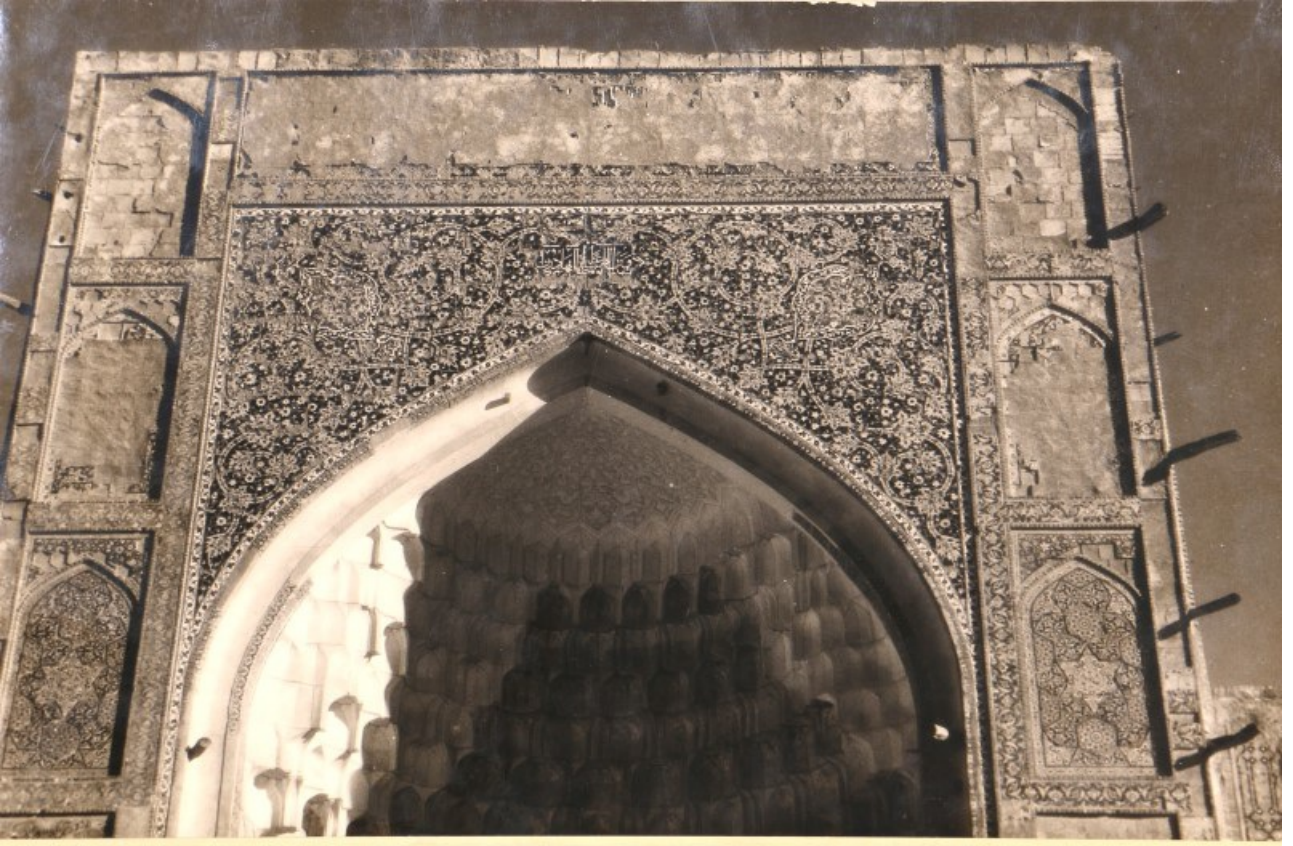
Bokhara. Fragment of the Abdul-Azis-Khan Medresseh. 1651-1652