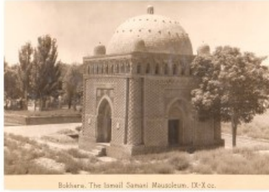
Bokhara. The İsmail Sanai Mausoleum. IX-Xcc.