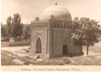
Bokhara. The İsmail Sanai Mausoleum. IX-Xcc.