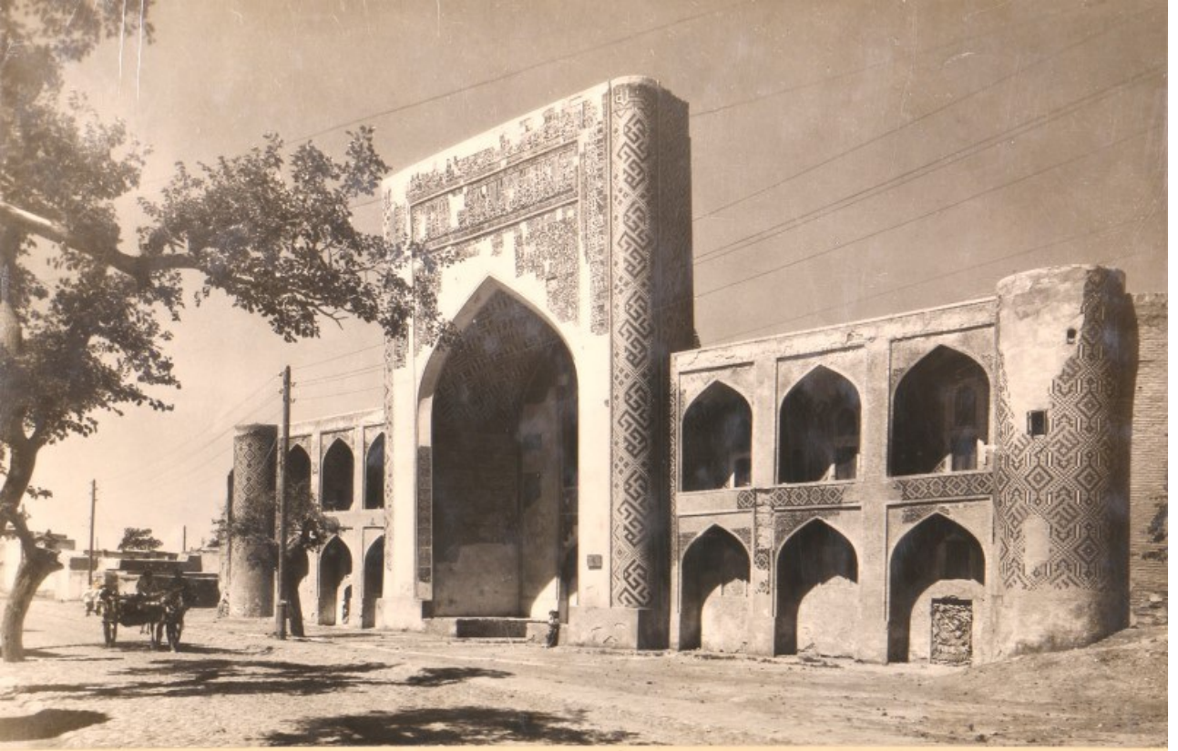
Bokhara. Abdulla-Khan Medresseh. 1590