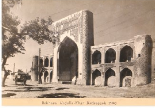
Bokhara Abdulla-Khan Medresesi 1590