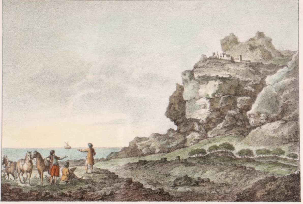
VUE DE LA MONTAGNE DE S. ETIENNE..